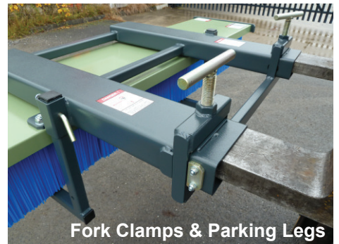
Fork Clamps & Parking Legs