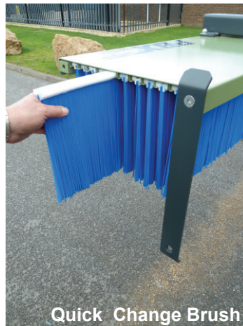
Quick Change Brush